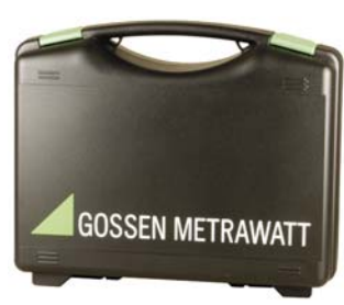
F836 Ever-Ready Case For multimeter and accessories

For two multimeters (with/without protective rubber holster) and accessories